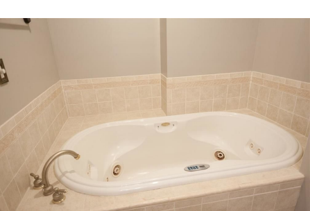
BLC # 21399325

Grab the absolute best margarita in town at 110 E. Washington's Adobo Grill before heading up to entertain friends on the balcony of your super cool 2BR/2BA 11th floor condo in the heart of Downtown. Live a short walk to Colts & Pacers games! Enjoy hip urban living while taking in cool views of Downtown. Open floor plan with nice kitchen featuring maple cabinets & breakfast bar. The living room flows to an office area off a spacious master suite with large, walk-in closet. Pamper yourself in the jetted whirlpool tub off the second bedroom. Decor & amenities include freshly painted gray walls, maple floors, built-in speakers, ceiling fans & custom window coverings. Stay out of the rain using your parking space in the connected garage. Add personal touches to make this your Downtown dream space!